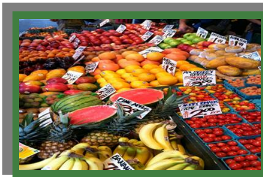
Fresh Fruit at Pike Place Market in Seattle, WA YUM!

Vegetarian. Vegan. Atkins. The Mediterranean Diet. South Beach. The Word of Wisdom. Have you heard of these different types of eating patterns? How do they differ? Are they healthy? Which one is healthiest? Why? We invite you on a journey this semester to explore the science of nutrition, to learn the language of nutrition and how to analyze food and food patterns. We will discover many aspects of food including what happens to food when we eat, consequences of food choices/behaviors and take a scientific examination of controversial topics. Food and nutrition are all around us and affect each of us. We promise you as you prepare and participate in this class you will gain an understanding of food and nutrition to help you develop personal healthy eating patterns to improve your health and lifestyle.